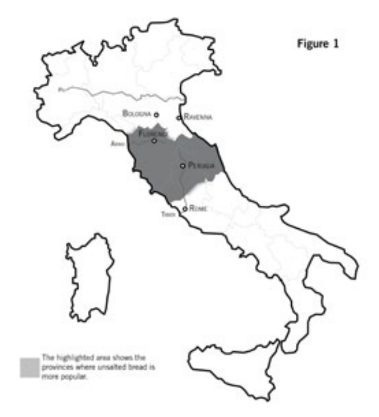
Figure 1 is an attempt to indicate graphically the "territory of unsalted bread": the provinces where unsalted bread is more common are shaded, while the "divided provinces" are indicated with alternate shading. As is evident, there is a very large swath of territory where one finds unsalted bread as the principal bread. Unsalted bread is not just found in and around Perugia, nor far from the coast, but throughout Umbria, down towards Rome, east to the Adriatic, and north up to the Apennines that divide Tuscany from Emilia-Romagna.

Oral tradition and popular books (especially cookbooks) offer reasons for which unsalted bread is eaten in one zone or another. The first